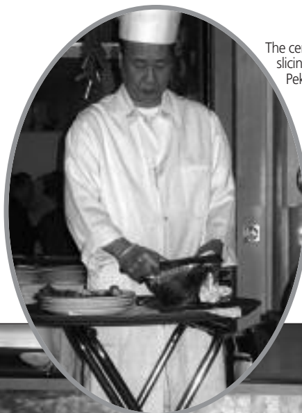
The ceremonial slicing of the Peking duck.