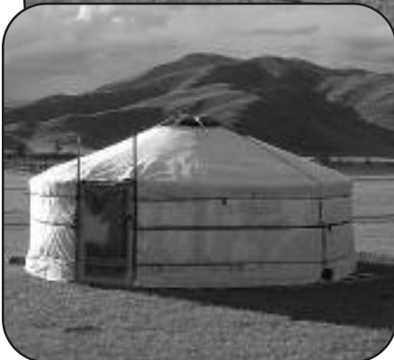
A typical yurt in Mongolia