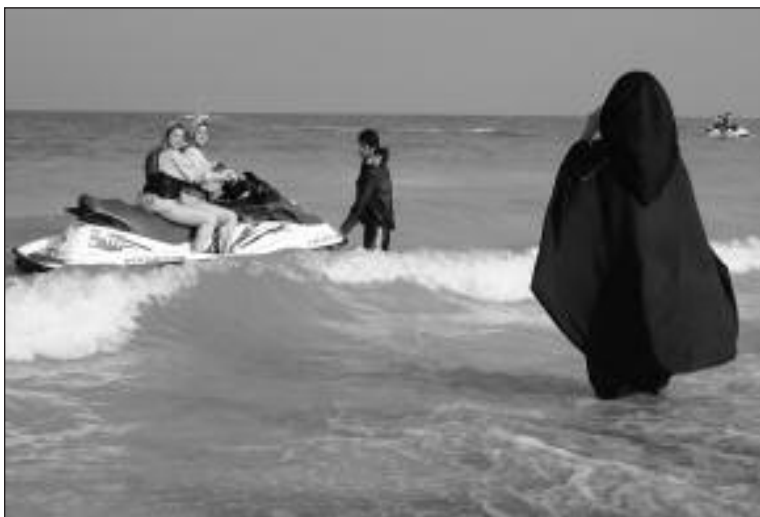
A mother taking photos of daughters on jet ski.