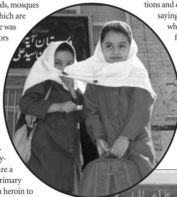
School girls greet us with smiles

We visited the Armenian Cathedral in Esfahan, which dates from the 1600s, when Shah Abbas invited Armenian craftsmen to move to Esfahan to perfect the carpet-making process. Because they are Christian they live apart from the Muslims and have had a presence in Iran for centuries. What about other religions? The