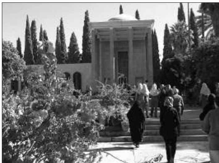
Hafez mausoleum in Shiraz

Today’s Iran is certainly different than it was 30 years ago. The population has mushroomed to 70 million. The cities and roadways are cleaner; no more garbage bags littering the streets and alleyways. However, Iran is more barren today, less green as a result of deforestation, desertification, drought, and pollution. Fortunately, the government is striving to address these environmental issues and has also signed on to many