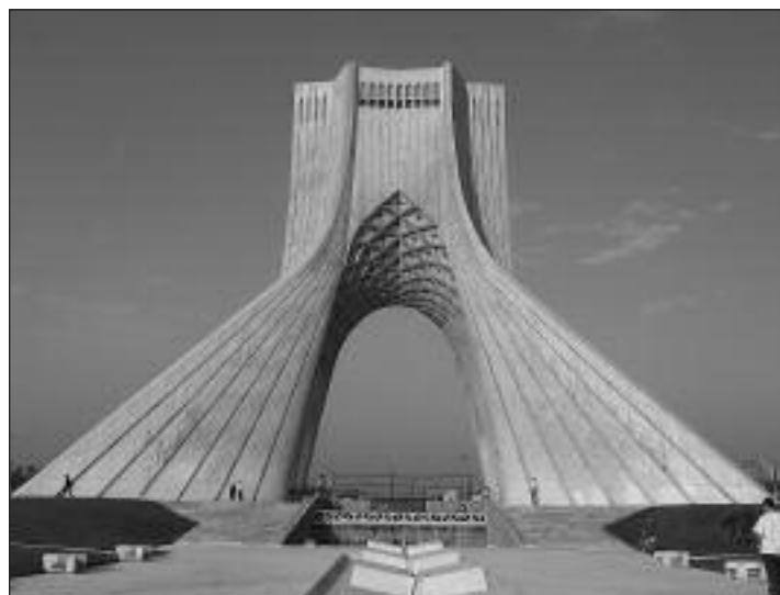
The marvelous Shahyad Tower, Iran's national monument.

"In 1978 over 50,000 Americans lived in Iran. It was a much more liberal country than its Muslim neighbors."