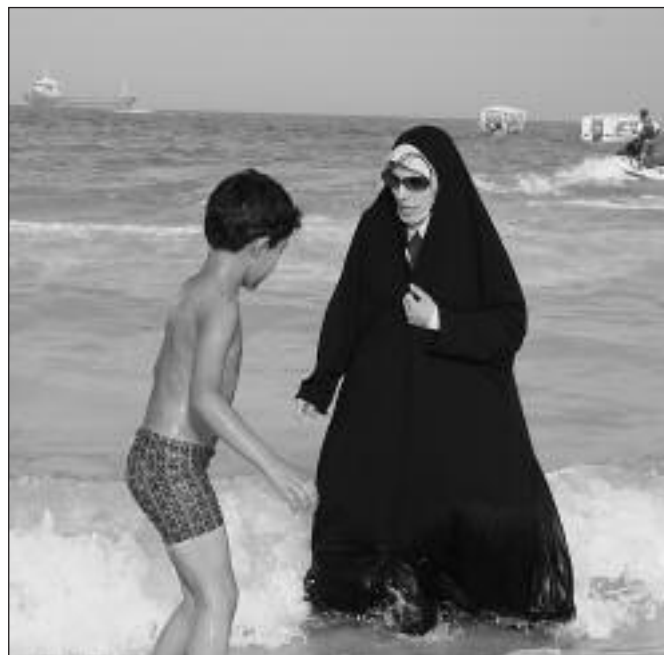
Burka clad mother in waves with son.