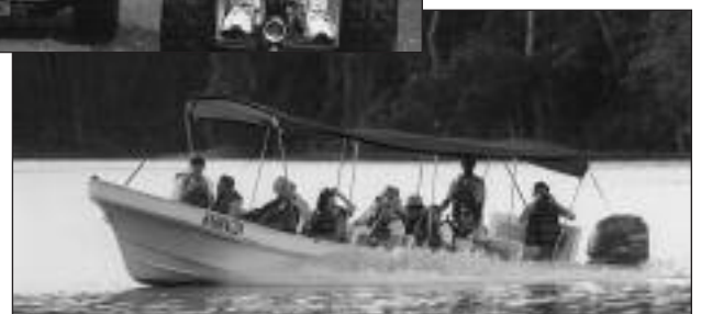
The canal boat ride was enjoyed by everyone.