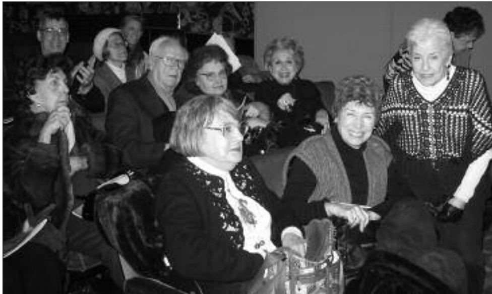
Members and their guests awaiting the show – Chinese New Year Splendor – at Radio City Music Hall.