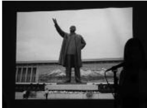
A slide of the statue of Kim Il-sung which is found everywhere.