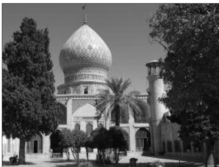
Imam Mosque/Shrine in Shiraz

By mid-November Iran was churning with demonstrations and riots and the Shah's government had ratcheted up its military response to social unrest. Martial law was declared and a curfew imposed. The English classes I taught at the language institute were canceled. Westerners were told to keep a low profile, stay out of south Tehran, and to remove our names from our mail-boxes. The kids' school bus was stoned by young Iranian students. Robert's office building was vandalized. The Intercontinental Hotel had its windows smashed in when a city bus plowed through the entrance and ended up at the registration desk.