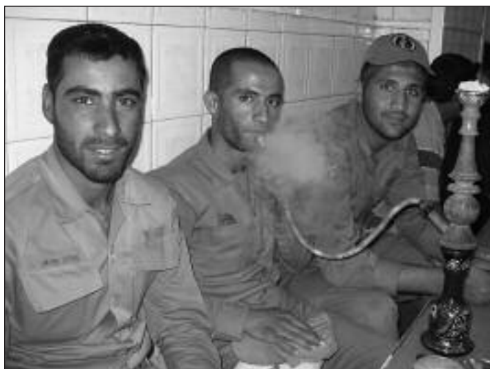
Soldiers share a smoke on a water-pipe.

Zoroastrianism is one of the world's first monotheistic religions. It was Persia's primary religion from 800 BC until 700 AD. Zoroastrians believe in heaven and hell, the last judgment, and salvation through good thought, word, and deed. They also believe creation is manifested in the four elements of earth, air, water, and fire. In ancient times they didn't bury their dead since that would defile the earth. They built towers opened to the sky with a central pit into which they placed their dead. Vultures would then pick the bodies clean. Today Iranians and Zoroastrians around the world celebrate the Zoroastrian holiday of New Year, No Ruz celebrated on the spring equinox.