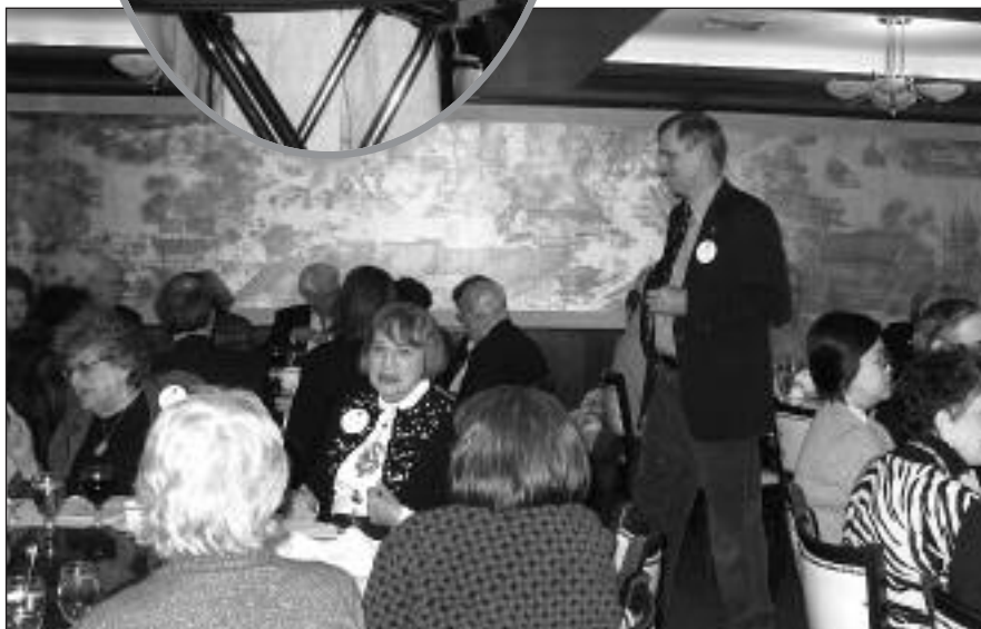
The Chinese New Year's Party is always a favorite.