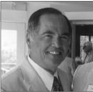
Featured speaker former C astronaut Robert Crippen, Captain USN (ret.).