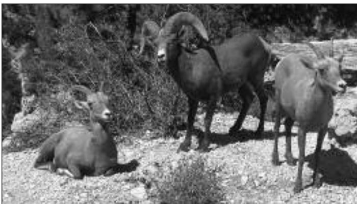
Bighorn sheep spotted during a walk.

Enormous walls of what appeared to be bottomless pyramids were tinged with a wash of gray, fading to pink, and then a quiet palette of