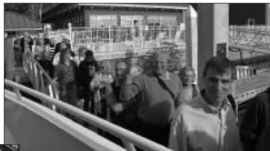
All Aboard! the Princess Yacht.

That evening donning our yachting clothes the transportation committee ferried people down to the Naples Princess yacht for a cruise on Naples Bay. The first deck was set aside for our group. Cocktails and socializing were followed by a roast beef dinner and dessert. The yacht took the inside canals and went by some of the largest homes, 55,000 square feet, that you will ever see. While on the yacht, you had the chance to see the sun set over the Gulf of Mexico as you lounged on the aft deck. Everyone was looking for the famous "red flash" on the horizon just as the sun sets.