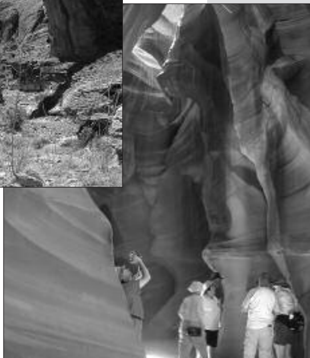
Page, Arizona – Navajo sculpted sandstone walls