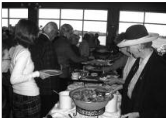
Lining up for a wonderful brunch served at the Naples Sailing and Yacht Club.