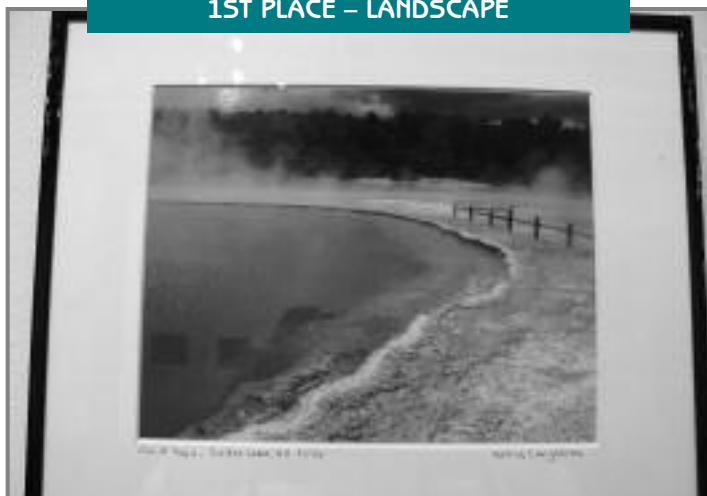
"Al-o-Tapu, Sulfer Lake" – Rotarura, New Zealand, November 2006.