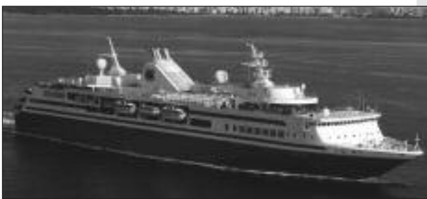
M.V. Explorer – Semester-At-Sea

I cannot rank these three voyages in any certain order. All were very different, but equally magnificent.