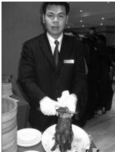
Slicing the Peking Duck.