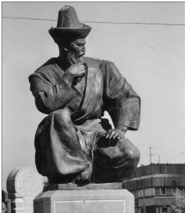
Father of Heaven statues in Registan Square, Almaty.