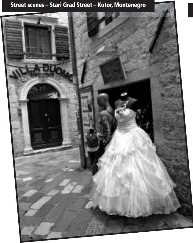
Street scenes – Stari Grad Street – Kotor, Montenegro