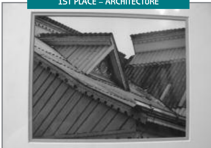
"Gables" – Tarpesti, Romania, August 27, 2007.