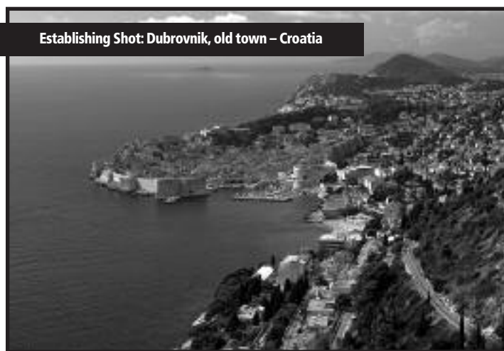
Establishing Shot: Dubrovnik, old town – Croatia

Establishing Shots: Seek out opportunities to hike or take a cable car up to the highest point in the city you'll be traveling in. Take a spin on the London Eye, or even venture up in the highest building or monument offering a public space from which to shoot. Ascend the elevator to the top of the Eiffel Tower, or climb the stairs leading to top of the dome at St. Peter's in Rome for a breathtaking view of the scene below. Upon approaching Dubrovnik from the south by road there is a commanding view of the Stari Grad, or Old Town, as it juts out into the sea and so I made a special point of asking the cab driver to pull over so I could capture what is often called “the jewel of the Adriatic” from above.