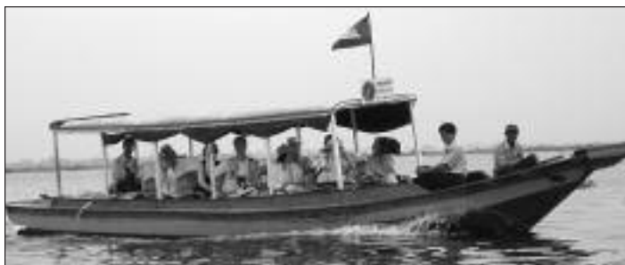
On the way to visit a village built on Cambodia's Tonle Sap River. Breakfast in Cambodia; Lunch in Thailand; Dinner in Myanmar!