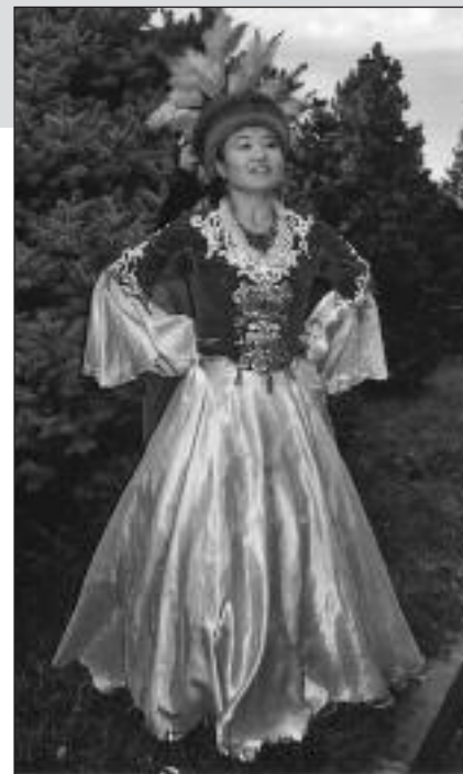
A Kazakh singer in national costume.

The 2007 movie referred to in the title- perhaps you know it - was banned in Kazakhstan.