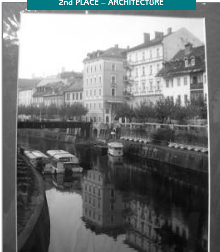
"Ljubljana River Scene", Ljubljana, Slovenia, October 17, 2007.