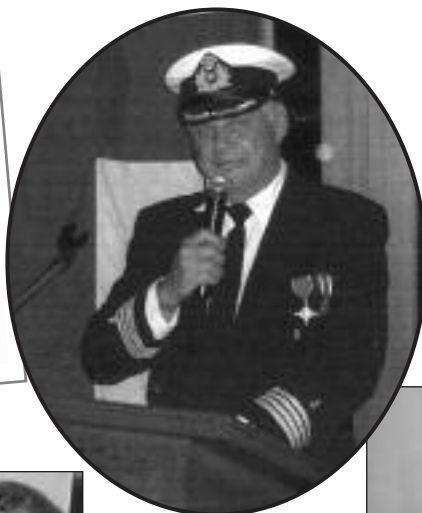
☛ Captain Charles Klotsche welcomed everyone aboard the Titanic !