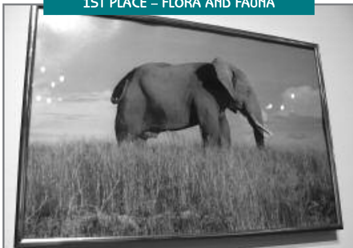
"Elephant" - Botswana, 1996.