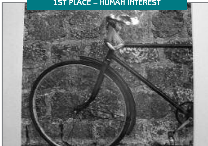
"Fish on a Bike" – Montenegro, October 9, 2007.