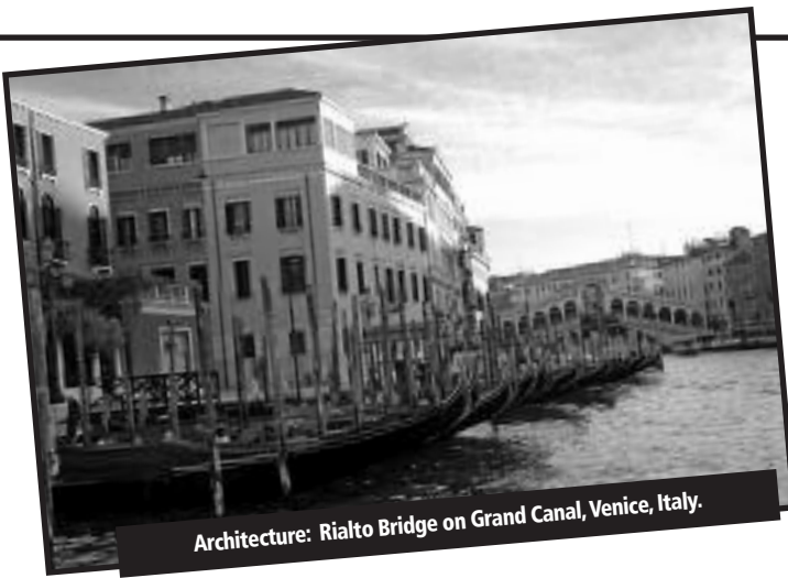
Architecture: Rialto Bridge on Grand Canal, Venice, Italy.

row of structures in a unique way, at the same time be sure to hone in on the details. A stunning photo of the overall site at Machu Picchu (another example of an Establishing Shot) should certainly be followed by close up images of the remarkable workmanship that went into the detailed stonework that makes up the ruins. By calling attention to the geometrically correct trapezoidal doorways and windows and stressing the intricacies of the joints and corners where the stones meet you'll convey to your audience the respect you had for the workers who carved the stones by hand.