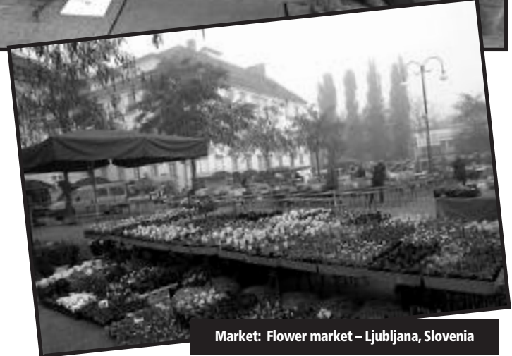
Market: Flower market – Ljubljana, Slovenia

The goal of any traveler looking to document a trip should be to capture the overall essence of the place to which he or she is traveling. Giving yourself the lofty but attainable assignment of capturing 10 to 20 keepers from each of the above categories, or at least the majority of them, will allow you to come back with a well-rounded collection of images