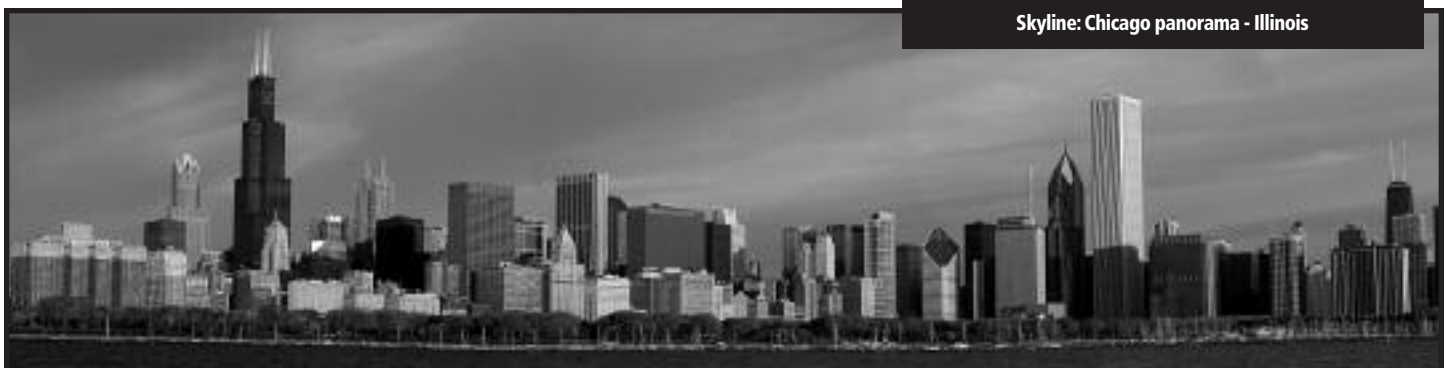
Skyline: Chicago panorama - Illinois

Skylines: The skyline of many cities has often been equated to their signatures. Chicago, for instance, has a skyline that is recognizable throughout the world, as is that of Sydney or San Francisco. Make an effort to seek out locations that will allow you to capture the entire city in a single shot, or with a series of shots stitched together into a single panorama. In Chicago, ideally you'd want to venture out to the Adler Planetarium, which sits at the end of a long peninsula and provides an uncompromising view of the city's unique skyline from the Shedd Aquarium in the south all the way out to Navy Pier in the north. This is a postcard shot to be sure, but it's a must for any travel photographer looking to capture the