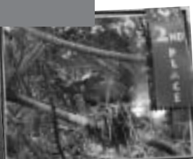
Second Place: Sue Murphy - "Juvenile Sooty Tern" Lord Howe Island, Australia 2010