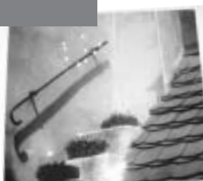
Second Place: Marion Green - "Roof Garden" Prague 2001