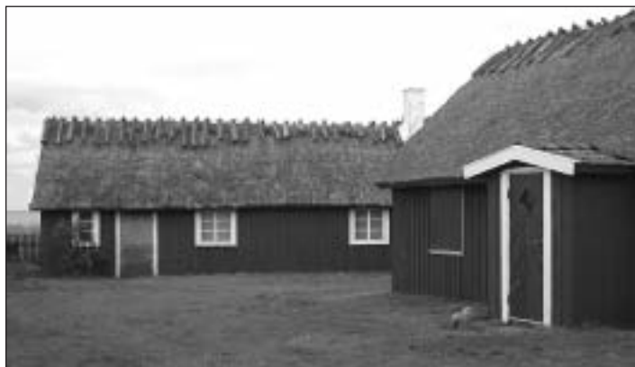
The Matson family home from 1865 in Sweden – 2009.

The week spent in Poland was a mixture of many emotions. At the onset of World War II, the Jewish population of Poland was 3.3 million. Today it is just under 25,000. All Circumnavigators have experienced the beauty and wonder when we have stood in old European town squares - our necks craning to take in the medieval architecture, perhaps a clock tower or an old town hall. All of this exists today in every city in Poland and yet something else is also present - a plaque affixed to a wall stating for instance: “...that 3,000 Jews stood in this square and were exterminated.” Or, in a small village, “...50 Jews were rounded up on a certain night and