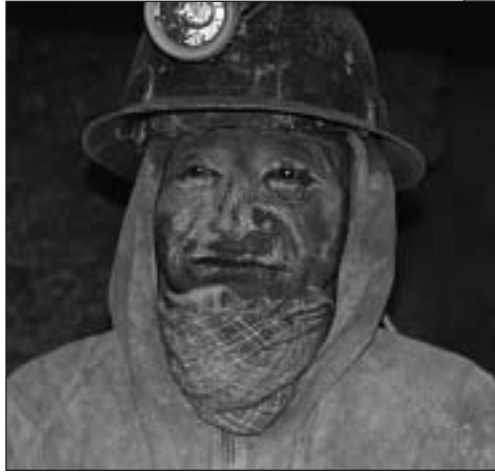
Silver miner at Potosi

Nearby Sucre, also a World Heritage site, is the birthplace of Bolivian independence with the declaration signed in 1825. The city remains the constitutional capital of Bolivia. Known as the White City since the 17th