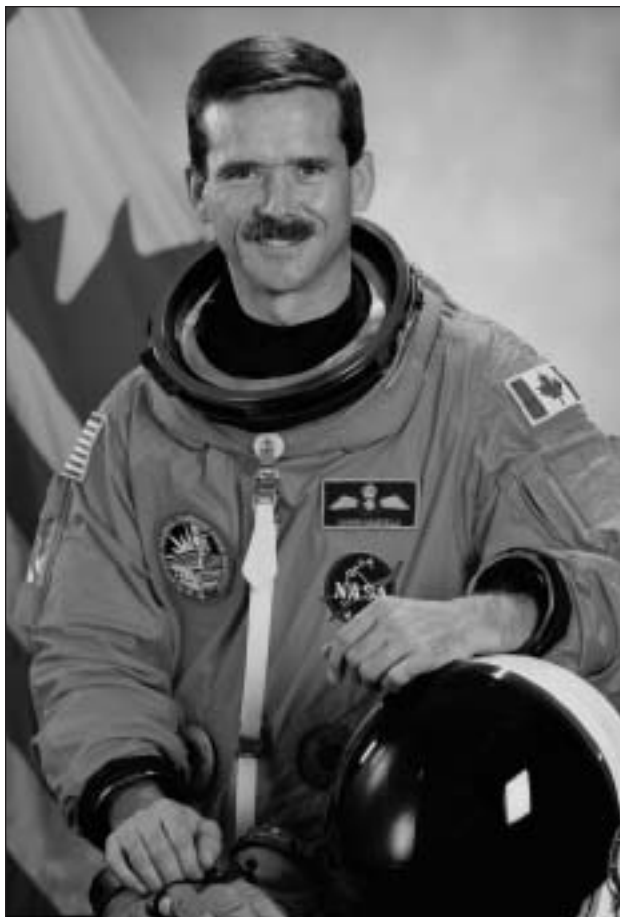
Astronaut Chris Hadfield - 1995

"We just have hot water and a microwave, so it's just prepackaged stuff to eat. Roll-up tortillas and dried food. It's like being on a camping trip. The food's okay. No sushi. We're in a sanctuary, so all the wildlife