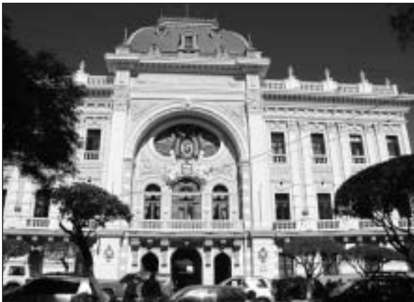
Government building in Sucre

Descending to 2,000 feet, our last destination was the western Bolivian Amazon with the entrance to Madidi National Park at Rurrenabaque.