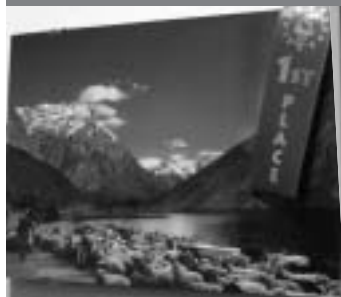
First Place: Cynthia Bassett - "Pamir Highway M41 at 7,000 ft." Klorag, Tajikistan