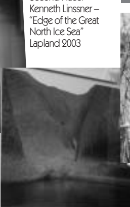
Second Place: Kenneth Linsner - "Edge of the Great North Ice Sea" Lapland 2003