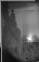
Third Place: Sue Murphy - "Uluru" Ayers Rock, Australia 2010