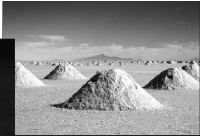
Largest salt flats in Uyuni

century, all of its central buildings are whitewashed annually. The magnificent cathedral with its bell tower dates from the mid-16th century and features an ornate altarpiece and pulpit, plus oil paintings of the apostles. Spanish influence was everywhere!