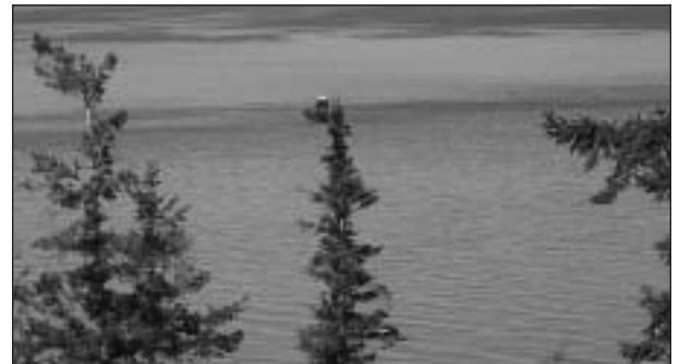
Bald eagle pair high atop a pine.

SUBMITTED BY CHAPTERPRESIDENT CHARLES STOTTS