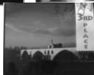
Third Place: Mimi Ragsdale - "Bridge at Avignon La Point d'Avignon" 1996