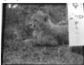
Beverly Anderson - "Cheetah Cub" Kruger National Park, South Africa 2008