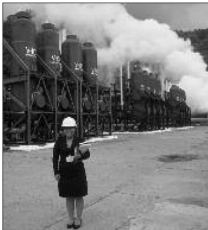
At the Dumaguete Geothermal field in Dumaguete, Philippines