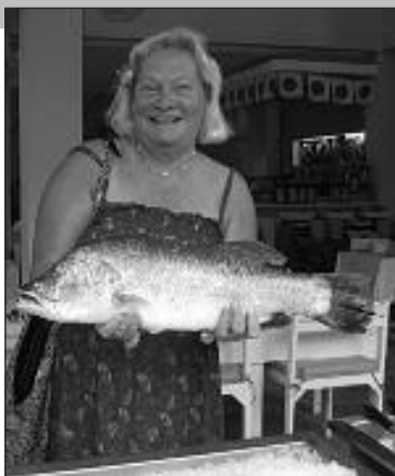
Here she is holding the "Catch of the Day" from the Andaman Sea, Phuket, Thailand.