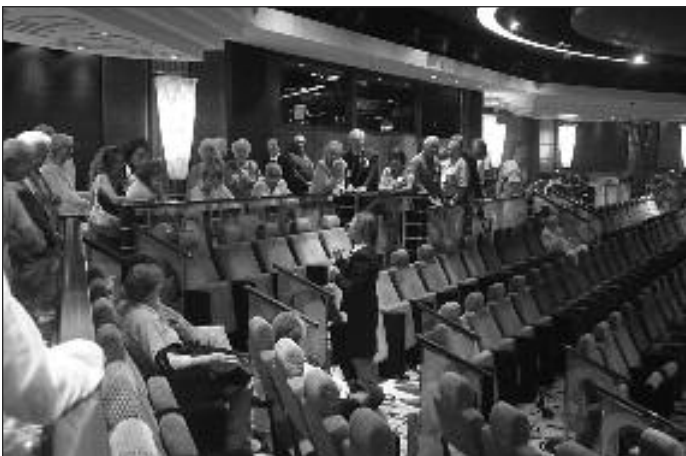
Listening intently to the guide in the planetarium.