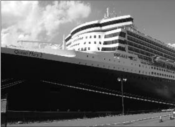
Photo taken of the QM2 when departing.