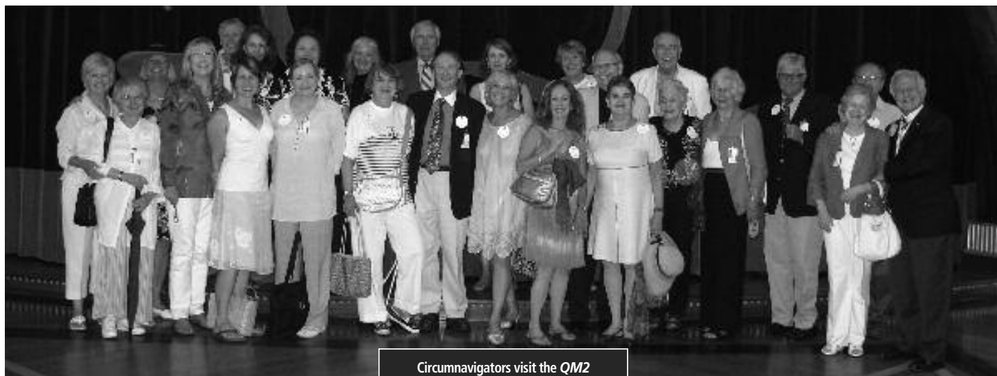
Circumnavigators visit the QM2