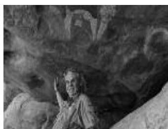
Las Geel cave painting.