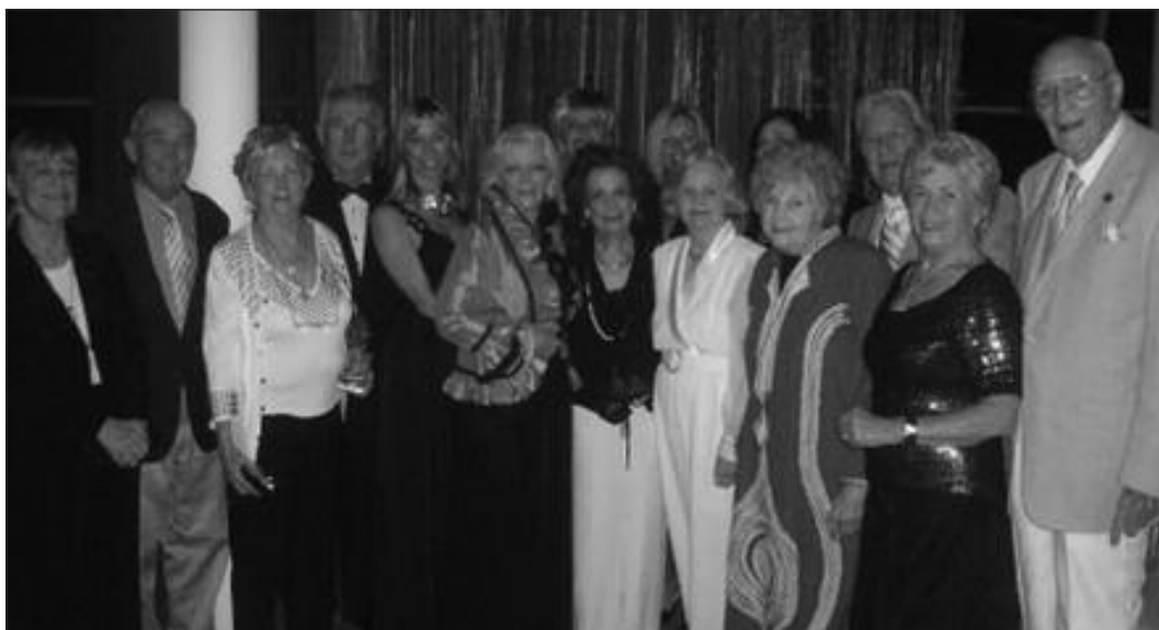
The gang of 20 enjoyed the week-long trip visiting ports-of-call of the eastern Caribbean.