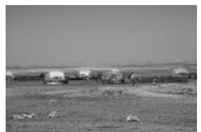
Typical dwelling in Somiland.