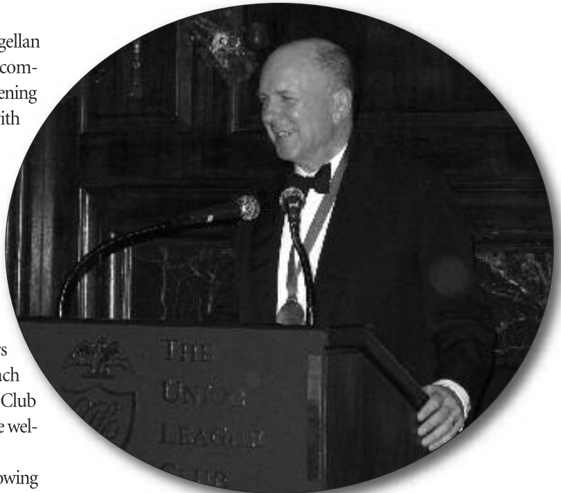
Simon Winchester thanked the Circumnavigators Club for this prestigious award.