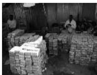
Money changer in Hargeisa. The stacks in front of him are Somaliland shillings.