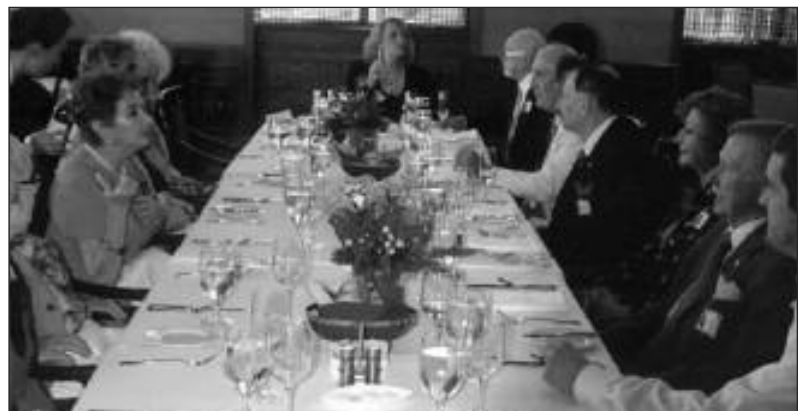
Miami Chapter members and guests enjoying their luncheon at the La Gorce Country Club.