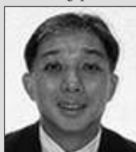
Low Yang Tong L4984 Singapore