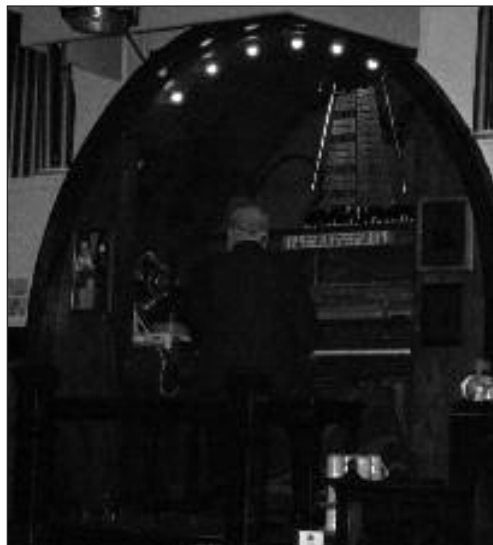
The piano player at the event entertained members and guests with traditional German tunes.